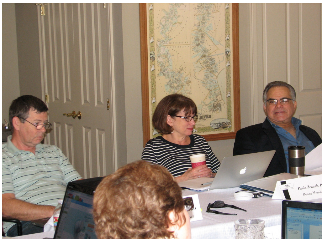
EC Members listen to updates on the new committees.